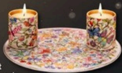
CANDLES NOT INCLUDED

With a love gift donation of $100 or more, we'll give you The New Covenant Revisited plus a decorative candle holder with attached tray, designed by renowned Israeli artist Yair Emanuel.